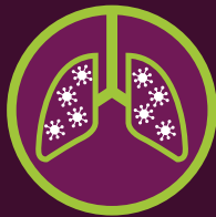
SEVERE ACUTE RESPIRATORY SYNDROME